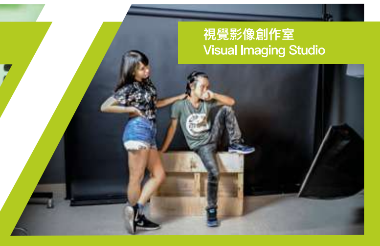
視覺影像創作室 Visual Imaging Studio

This is a high-definition video production and recording plant with a control room. It adopts a tapeless full HD video camera, which can provide high-definition signals for live TV broadcast and rebroadcast through industry-standard HD-SDI that is comparable to local TV stations. Students can do a variety of programme production practice here, such as talk shows and interviews. They can make use of chroma key technology via the blue or green background for adding special effects to post-production.