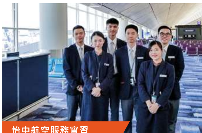
怡中航空服務實習

Hong Kong Association of Travel Agents Diamond Jubilee Celebration