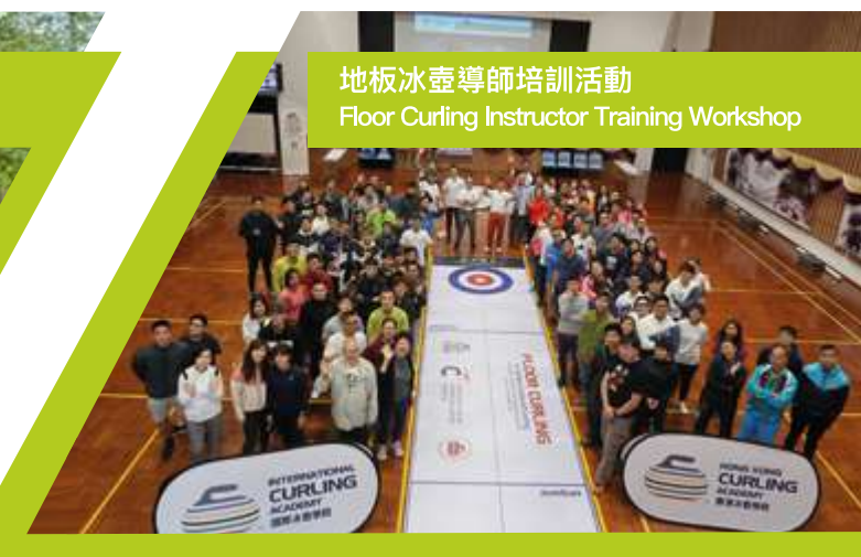
地板冰壺導師培訓活動 Floor Curling Instructor Training Workshop

Students won an award in the Tianfu Greenway International Cycling Fans Fitness Festival which was held in Chengdu, Sichuan.