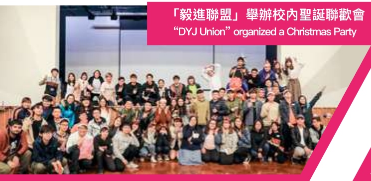
「毅進聯盟」舉辦校內聖誕聯歡會 “DYJ Union” organized a Christmas Party

Student Centre is a place gathering students to play, engage with each other, or have fun with different board games, musical instrument and magazines. The team stationed in Student Centre is mainly from social work and counselling background and they are keen to help students in difficulties. In addition, they develop students through practical experience by holding different types of activities.