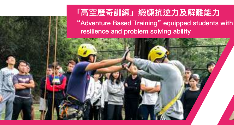
「高空歷奇訓練」緞練抗逆力及解難能力 “Adventure Based Training” equipped students with resilience and problem solving ability