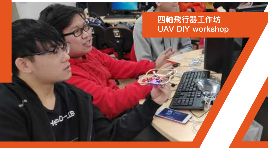
四軸飛行器工作坊 UAV DIY workshop