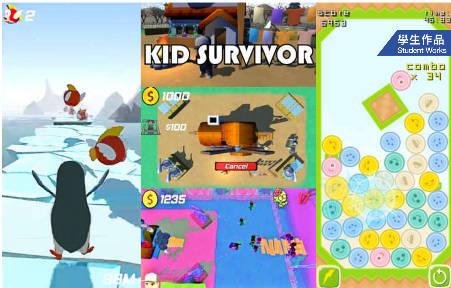
學生運用 Unity 和 3ds Max 創作不同類型手機遊戲 Students make different types of mobile games using Unity and 3ds Max.