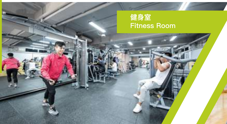
健身室 Fitness Room

為使學生可以全面理解不同健身器械及運動的理論，並達到專業實踐能力，港專特意投放資源興建不同的室內外體育設施，包括配置專業體適能訓練器材的健身室、全鏡式健舞室、標準籃球場等，務求讓修讀運動相關課程的學生提升自己個人運動水平，又能成為專業體適能教練。這些康體設施在課餘時亦開放予全校學生使用，鼓勵學生保持身心健康，並加強學生對學校的歸屬感。