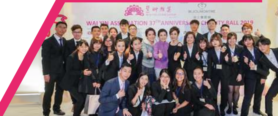
「慧妍雅集週年慈善晚會」 “Wai Yin Association Anniversary Charity Ball”

HKCT has been cooperated with a charity organization, Wai Yin Association in organizing the Charity Ball for 9 years. Through working in the event, students can widen their horizon, enrich working experience, and equip with crisis management skills and social etiquette.