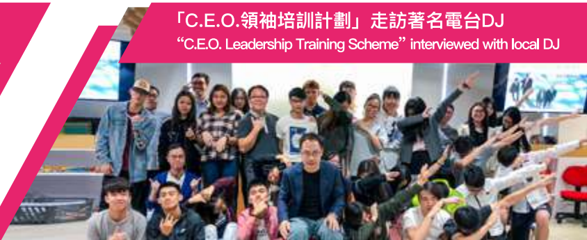
「C.E.O.領袖培訓計劃」走訪著名電台DJ “C.E.O. Leadership Training Scheme” interviewed with local DJ