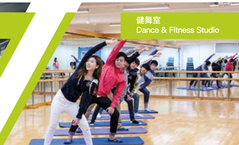
健舞室 Dance & Fitness Studio

HKCT has dedicated resources to build different indoor and outdoor sports facilities, including a fitness room that houses professional fitness training equipment, full-mirror Dancing Room, and a standard basketball court, in order to allow students who take sports-related programmes to improve their personal athleticism and become professional fitness coaches. These recreation and sports facilities are also open to HKCT students in general to encourage them to maintain physical and mental health and strengthen students' sense of belonging to the institute.