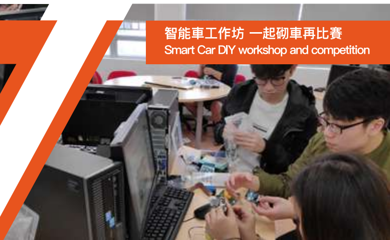
智能車工作坊 一起砌車再比賽 Smart Car DIY workshop and competition