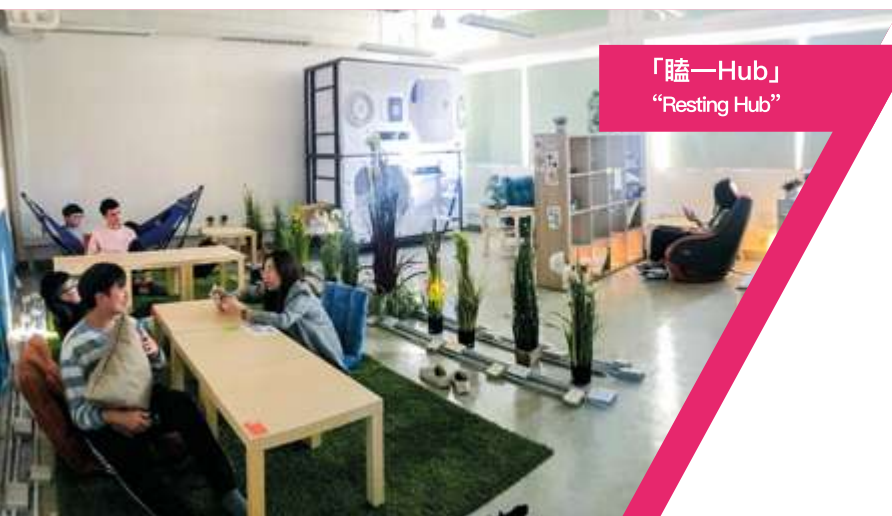
「瞓一Hub」 “Resting Hub”

設置一個舒適悠閒的場所，讓同學可以小睡片刻，以達至改善學生睡眠質素。這裡亦提供舒緩情緒與壓力的方法，以培養學生有優質之精神健康。這房間讓同學關注個人的睡眠質素及心理健康，提昇對珍愛生命的積極性。