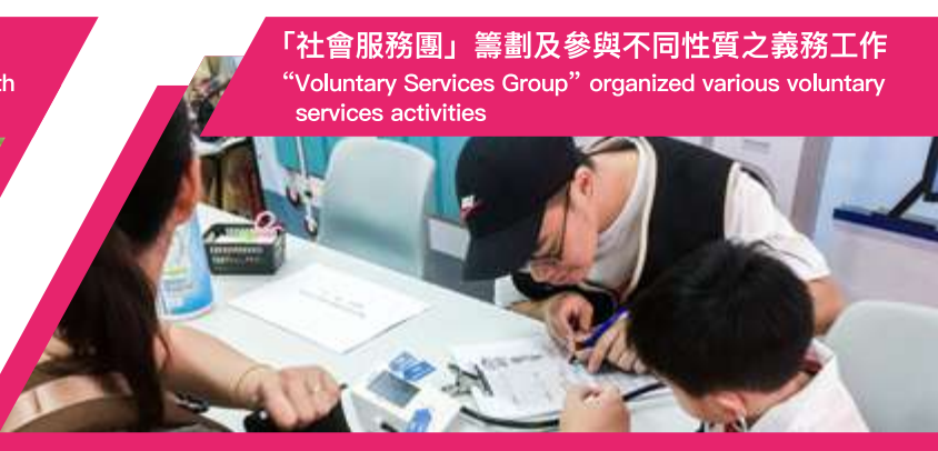
「社會服務團」籌劃及參與不同性質之義務工作 “Voluntary Services Group” organized various voluntary services activities

學生組織 — 透過學生組織的平台，培訓學生多元能力及軟技巧，更提供不同試練機會，將所學得以應用。配合檢討、反思、改進，讓學生在過程中認識個人特質及專長，從而針對性地加以發展。