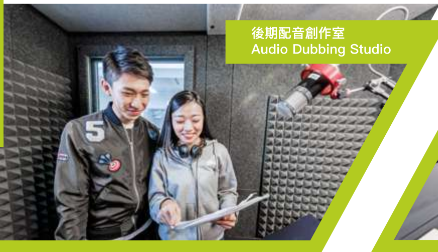
後期配音創作室 Audio Dubbing Studio

配音及混錄是電影及電視常見的後期製作工序，後期配音創作室備有各式混音及錄音設備、具隔音功能的錄音室、配備行業中會使用到的 Audio Pro 軟件，讓修讀媒體製作相關課程的學生可在此練習製作旁述、聲效混錄及多聲道錄音。