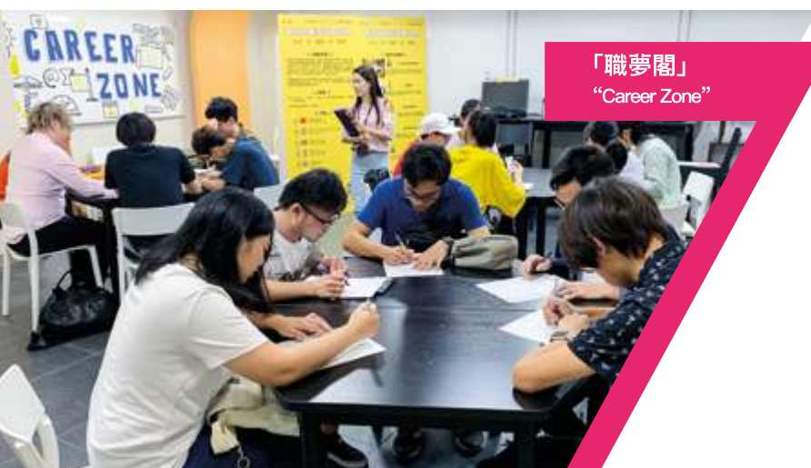
「職夢閣」 “Career Zone”

透過輕鬆有趣的桌上遊戲，讓學生認識工作世界，加深對自己的了解，更有效促進朋輩溝通和互動。職夢閣也提供面試及職場技巧之訓練，為學生將來投身社會作好準備。