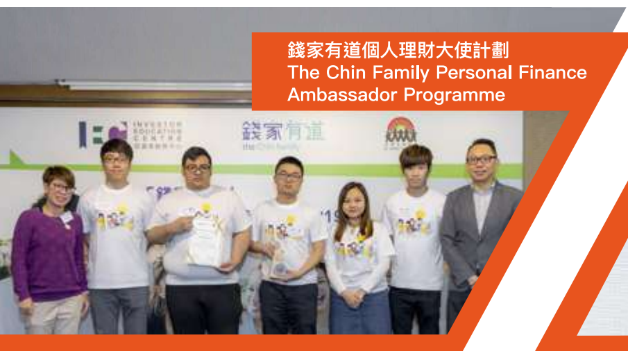
錢家有道個人理財大使計劃 The Chin Family Personal Finance Ambassador Programme

A talk series and workshops included topics of intellectual property, commercial development platform demo, Internet of Things, Unity, Unreal Engine, AR and Steam VR.