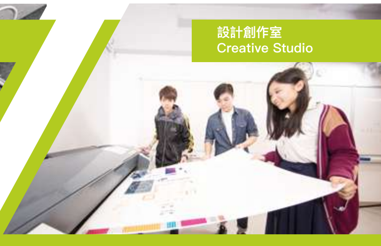
設計創作室 Creative Studio

Dubbing and mixing are common post-production processes in movies and television production. This Audio Dubbing Studio equipped with various mixing and recording equipment, soundproofing room, and Audio Pro software that are commonly used in the industry allow students to practice and produce narration, sound mixing and multi-channel recording during their study.