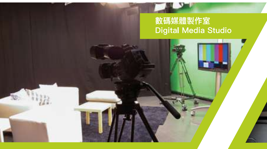
數碼媒體製作室 Digital Media Studio

HKCT understands that creativity requires enough space to be fully realized, so it provides this spacious studio for students to discuss, brainstorm, and pursue creative activities. This Studio is equipped with 3D printers, large-scale printing machines with flexible partition setting. When necessary, it will open 24 hours and separate into individual studios, so every design student can feel at ease to focus on their own graduation works.