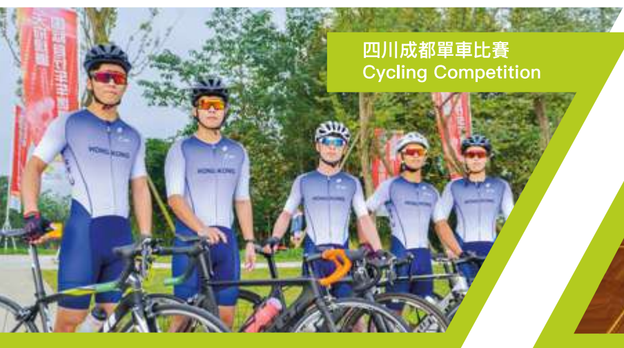
四川成都單車比賽 Cycling Competition

This is a multi-functional and full-mirror spacious studio that is for sports related activities. Beside this Dance & Fitness Studio, HKCT has dedicated resources to build different indoor and outdoor sports facilities, such as a fitness room that houses professional fitness training equipment and a standard basketball court, in order to allow students who take sports-related programmes to improve their personal athleticism and become professional fitness coaches. These recreation and sports facilities are also open to HKCT students in general to encourage them to maintain physical and mental health and strengthen students' sense of belonging to the institute.