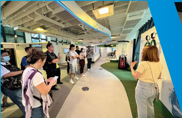
Students visited the Innovation Hub (iHub) to learn about the latest advancements in construction technology.