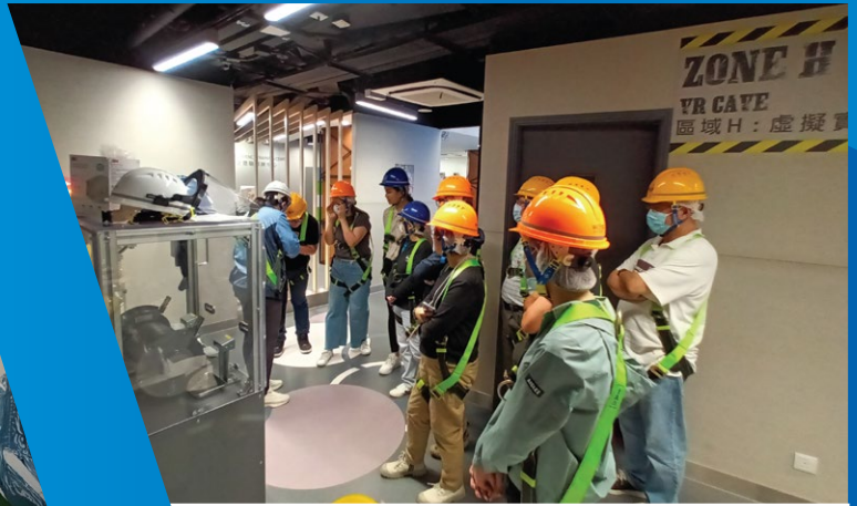
Safety Experience Training to enhance the safety awareness of construction students